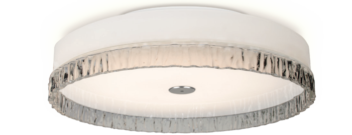
PACO12SMC OPAL/SMOKE STONE