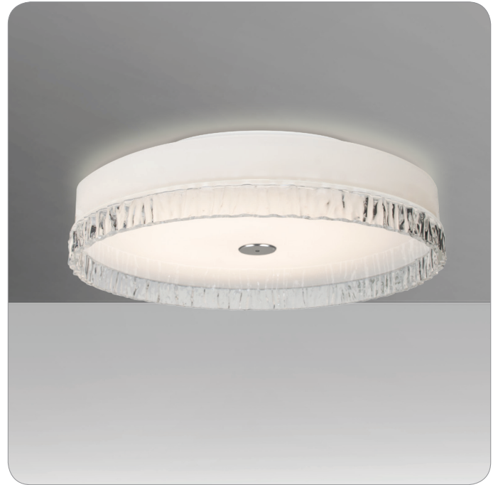
OPAL/CLEAR STONE (PACO12CLC)